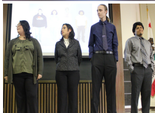
Before & After Makeover ed by a SB70 grant.

CCOC held its first Career Technical Education student trade conference on November 9 for 2011-12. The Business, Finance & Technology all-day "real world" conference was a huge hit with students from CCOC's Managerial Accounting, Computer Technology Careers, Office Assistant, and Small Business Management programs.